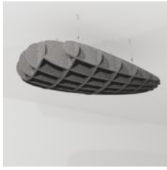
Clouds Stratus Detail