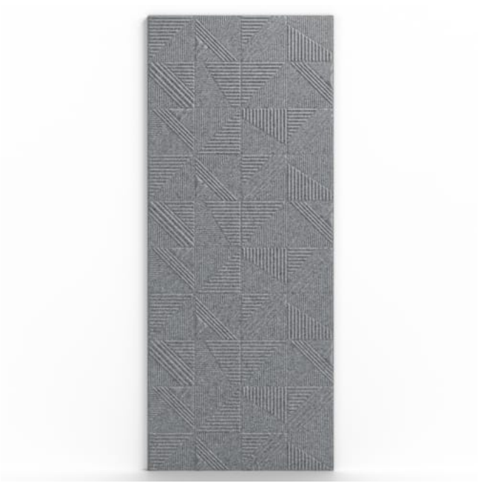
Emboss Panel Tapestry Detail