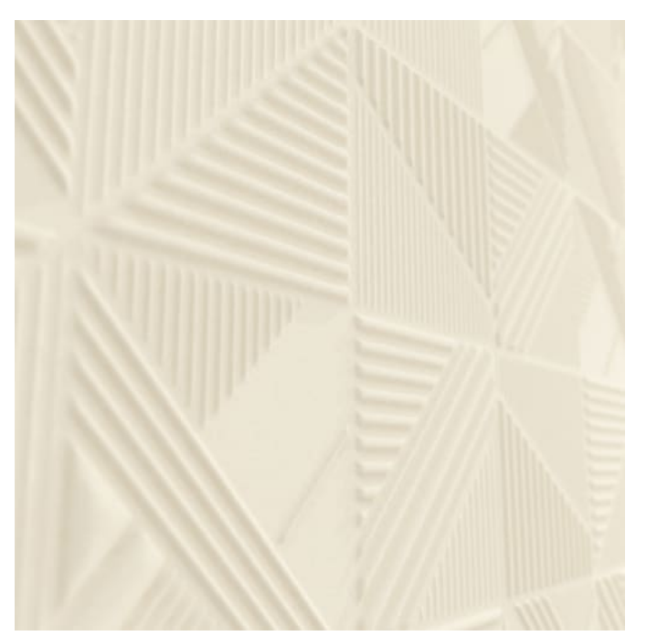
Emboss Panel Tapestry Ivory Detail