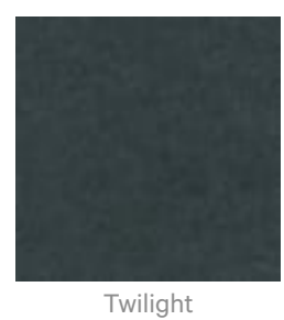
Zintra Timber Print