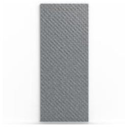
Emboss Panel Molecular Detail