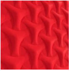
Emboss Panel Linked Ochre Detail