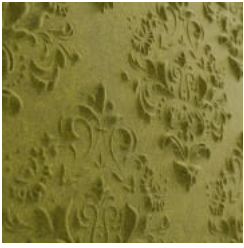
Emboss Panel Damask Detail Olive