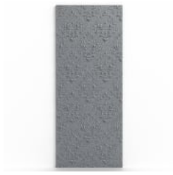
Emboss Panel Damask Detail