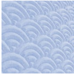
Emboss Panel Cumulus Detail Sky