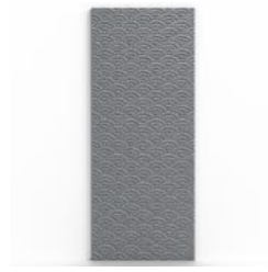
Emboss Panel Cumulus Detail