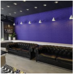
Emboss Panel Cumulus Cobalt 2