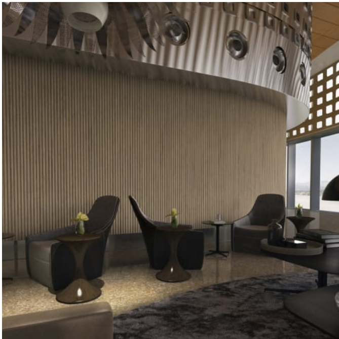
Emboss Panel Corduroy Spotted Gum