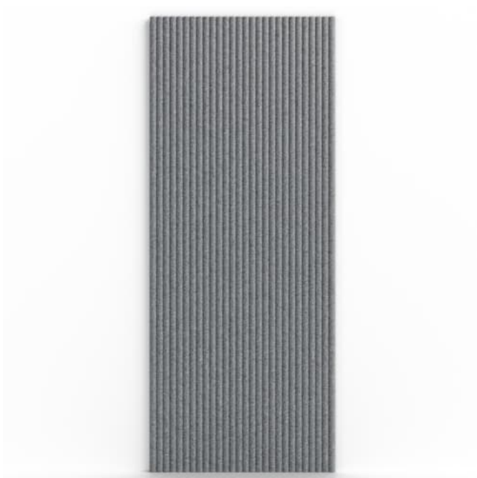
Emboss Panel Corduroy Detail