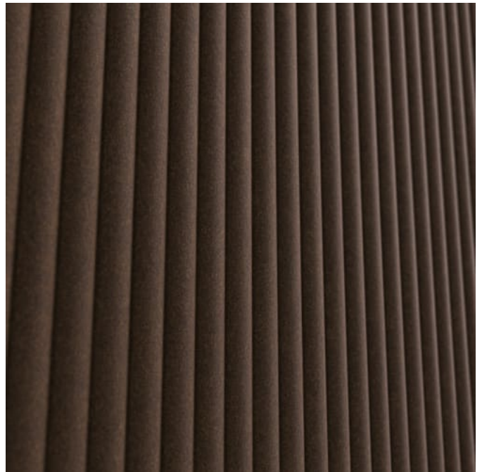
Emboss Panel Corduroy Detail Bark