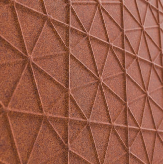
Emboss Panel Constellation Detail Brick