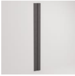
3D Panel Batten 4 Detail