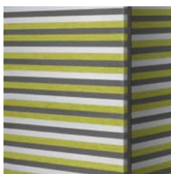
Layers Panel Frost, Greige and Grass Detail