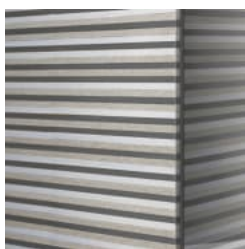
Layers Panel Frost, Greige and Fossil Detail