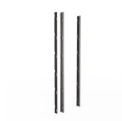
Independent Sticks Wide Exploded Detail