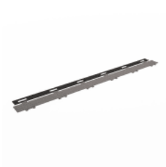
Independent Sticks Narrow Flat Detail