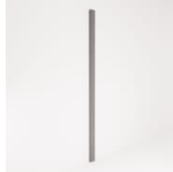
Independent Sticks Wide Single Detail