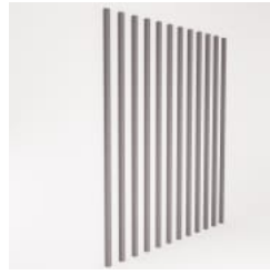
Independent Sticks Narrow Bundle Detail