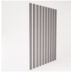
Independent Sticks Wide Bundle Detail