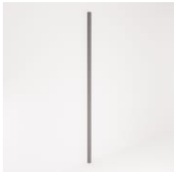
Independent Sticks Narrow Detail