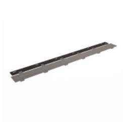
Independent Sticks Flat Detail