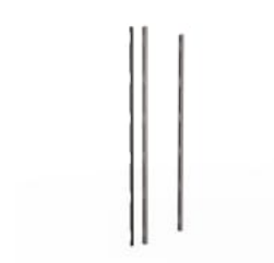
Independent Sticks Narrow Exploded Detail