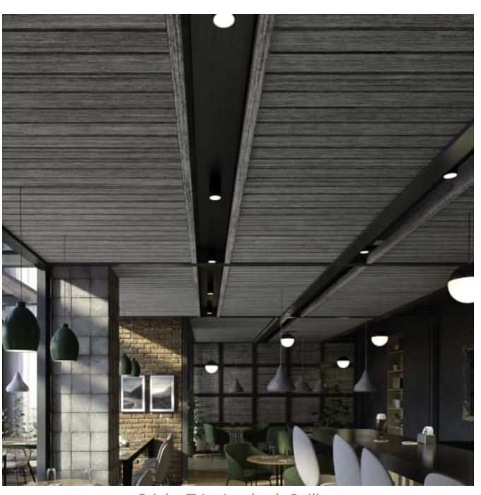
Sticks Trim Ironbark Ceiling