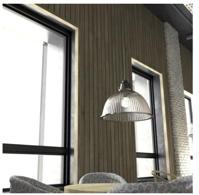
Sticks Trim Spotted Gum