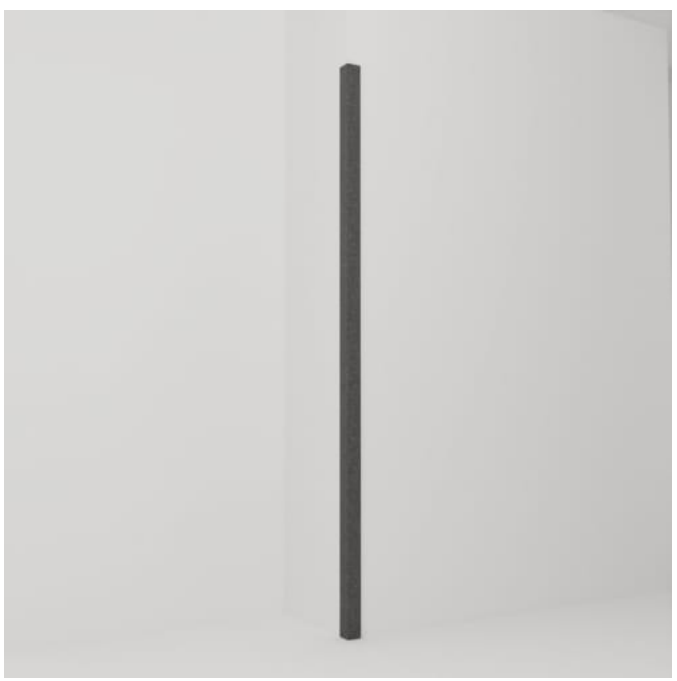
Sticks Trim Detail