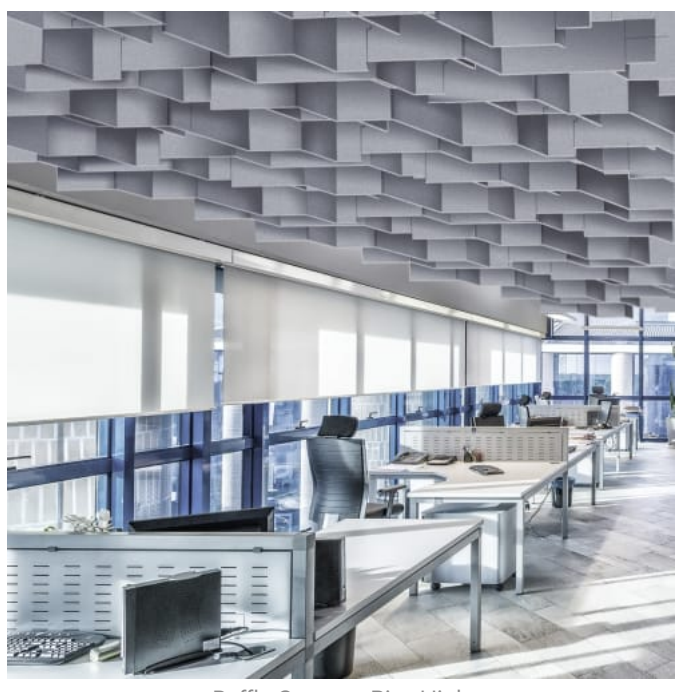
Baffle Connect Rise High