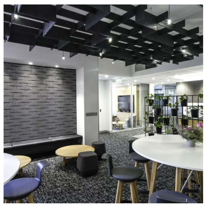
Baffle Connect Rise Low Tar