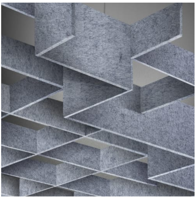
Baffles Connect Rise Detail in Cadet