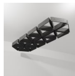
Baffles Connect Prismatic Detail