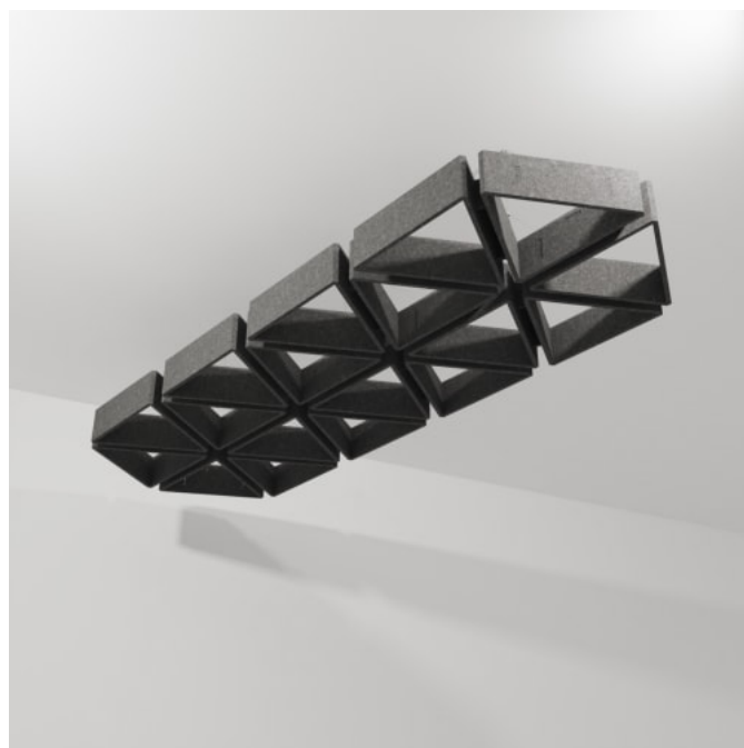
Baffles Connect Prismatic Detail