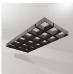
Connect Baffle Cubix Detail